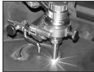
Small circle cutting attachment 30-120mm (1 1/4 - 4 1/2 in)