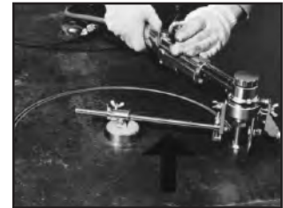
Extra large circle cutting attachment 120-1000mm (5-40 in)